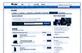
Tvinci's OTT platform