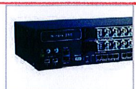
The Nimbra 380 platform from Net Insight