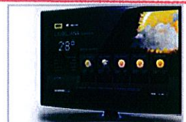
Telekom Slovenije's service using Netgem STBs and middleware